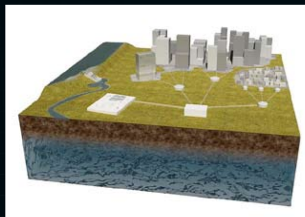
SEG pumps can be used for alternating or continuous operation throughout the water cycle. See examples online.