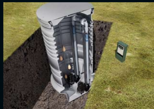
Installation options include submerged installation on auto-coupling with guide rails.